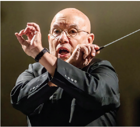
Dennis Russell Davies leads the Filharmonie Brno Philharmonic

Aging Cossack Taras Bulba reigned supreme when Filharmonie Brno Philharmonic, the Czech orchestra conducted by Dennis Russell Davies , per-