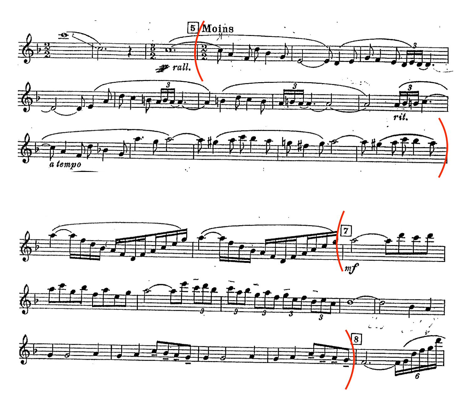
Villa Lobos - Fantasia, rehearsal number 5-6 AND rehearsal number 7-8 half note = 80